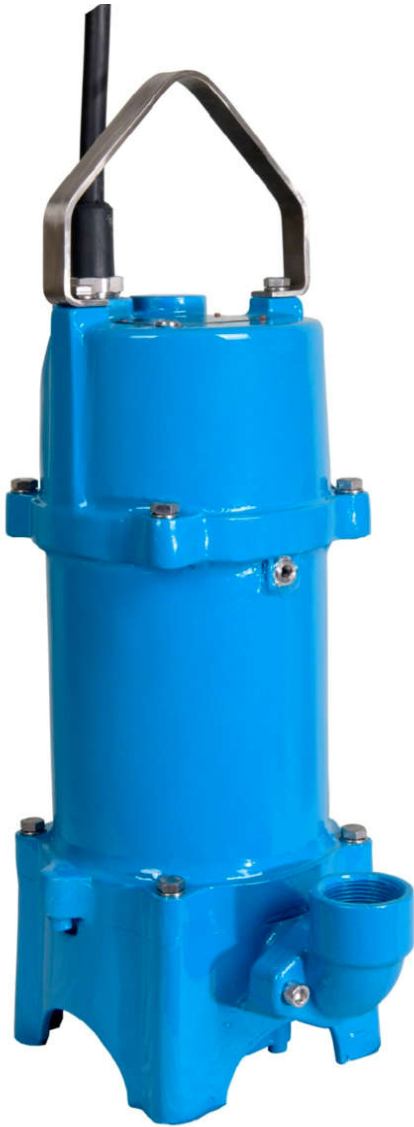
Model: FNG2-21C 2HP, 3450RPM, 60Hz