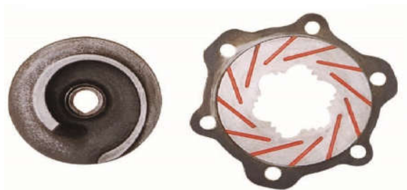
Tungsten carbide tipped grinder impeller

Model: WQ-0.75QG1, 115V WQ-0.75QG2, 230V WQ-0.75QG3, 230/460V, 3PH.